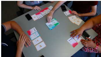
Figure 2: A gameplay session with four players.